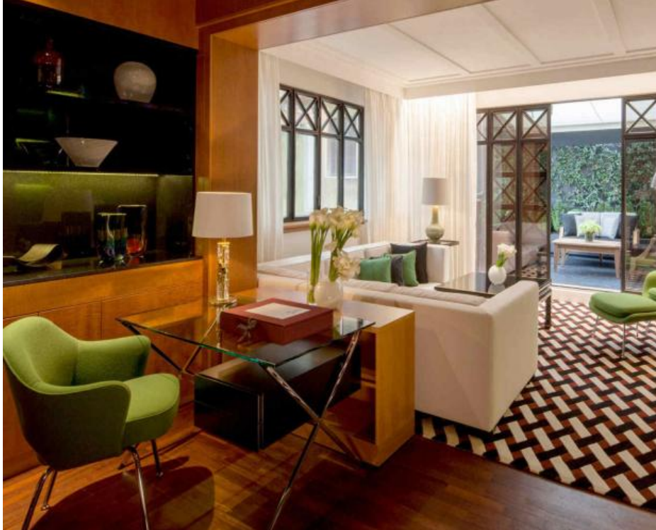
The Fashion Suite at Four Seasons Hotel, Milan

The top 10 things to see and do during Milan Fashion Week, including the best exhibitions, restaurants and shops.