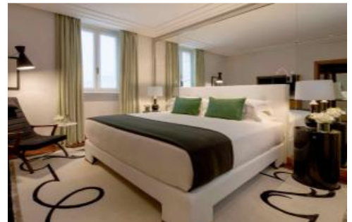
The Fashion Suite at Four Seasons Hotel, Milan

Rooms from €580 per night and the Fashion Suite from €4,700 per night.