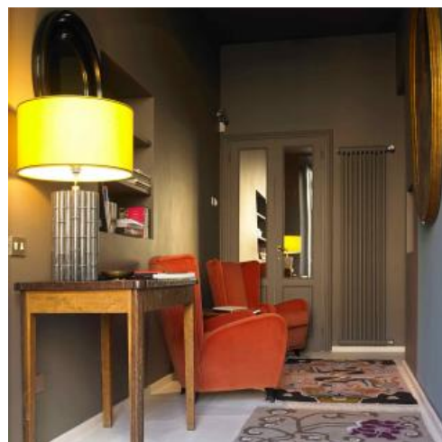
LaFavia Four Rooms, Milan