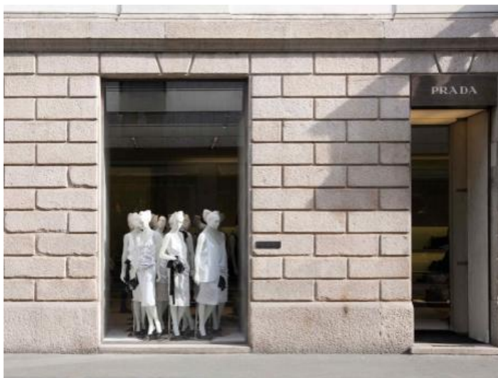
Prada: The Iconoclasts window and boutique, Milan, 2009

It all started in 2009, when four renowned fashion editors remixed Prada stores around the world. The Iconoclasts project now adds another chapter, the first of a new series, marking the fashion week in Milan. Edward Enninful, fashion and style director of W magazine, will create the display for the Prada stores in Via Montenapoleone 6 and 8. The fashion crowd is called to celebrate with an invitation-only cocktail event on February 20 and the display will be on show from February 21-24.