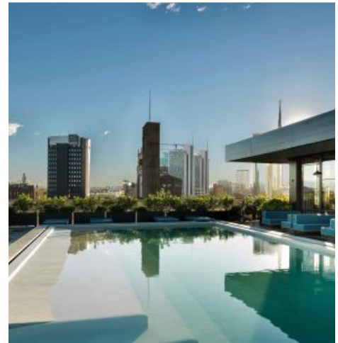
Ceresio 7 Pools & Restaurant, Milan