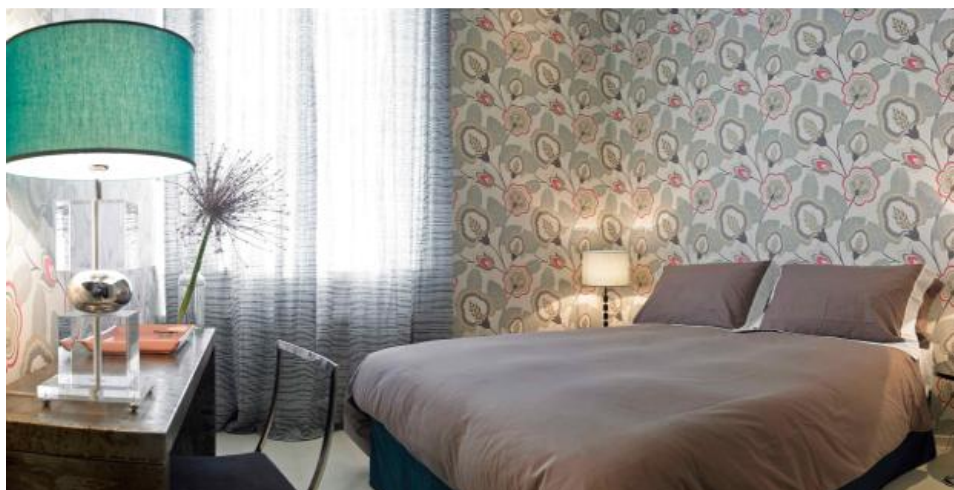
LaFavia Four Rooms, Milan