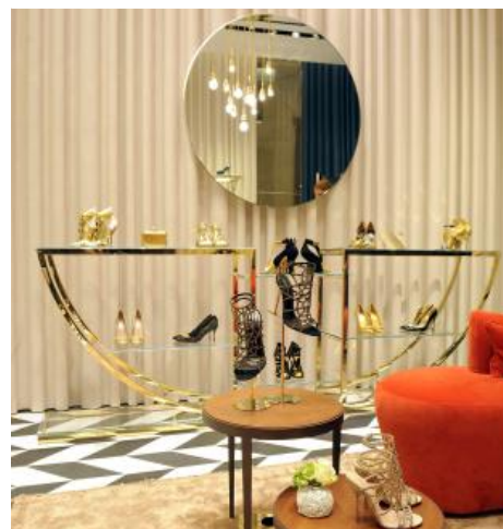
Sergio Rossi boutique, Milan

The space also boasts a new corner dedicated to Sergio Rossi's men's footwear collection, making it a great stop-off between the hectic shows.