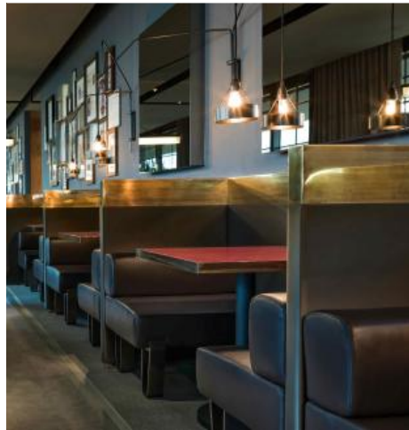
Ceresio 7 Pools & Restaurant, Milan

The decor by Dimore Studio is somewhat magical, mixing old and new and matching colours in unexpected ways, while the spatial design is symmetrical in every detail, from the fireplaces to the two swimming pools on the terrace. The chance to admire the venue is actually reason enough to visit, but here you'll also find chef Elio Sironi, formerly of the Bulgari hotel, serving delicious Italian fare.