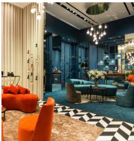
Sergio Rossi boutique, Milan

Revamped in the autumn of last year with a restyling by London design firm Studioilse, the four-windowed Sergio Rossi boutique in the heart of Milan's 'quadrilatero' features two distinct spaces and ambiances: the front stage, with curvy display units contrasting with the geometry of the black and white marble floor, and a more intimate backstage, coloured in a shade of deep blue.